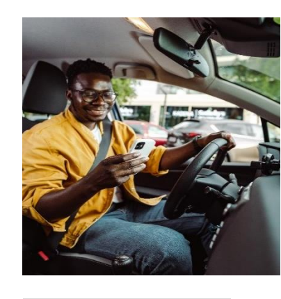
TECHNOLOGY TO SIMPLIFY TRIP VERIFICATION

NEMTAC is developing passenger verification in lieu of signature technology standard for confirming rider pickups and drop offs. The COVID-19 pandemic highlighted the challenges of collecting and verifying physical signatures, leading to widespread use of alternative signature collection methods and more precise verification of passenger identity during transportation services.